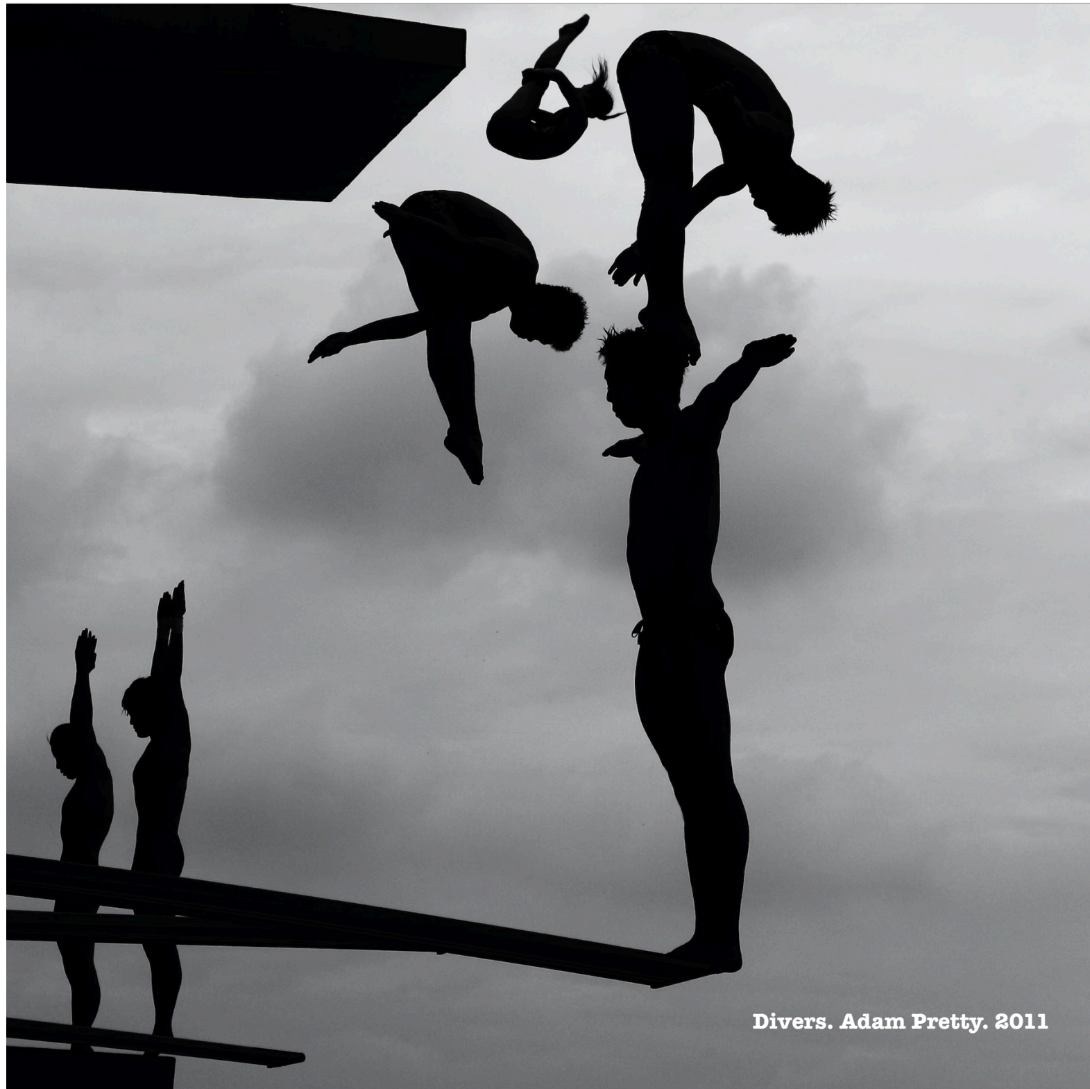
Divers. Adam Pretty. 2011

Underexpose your subject to create a backlit silhouette.