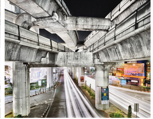
Bankok (Cityscapes). Luca Campigotto. 2006