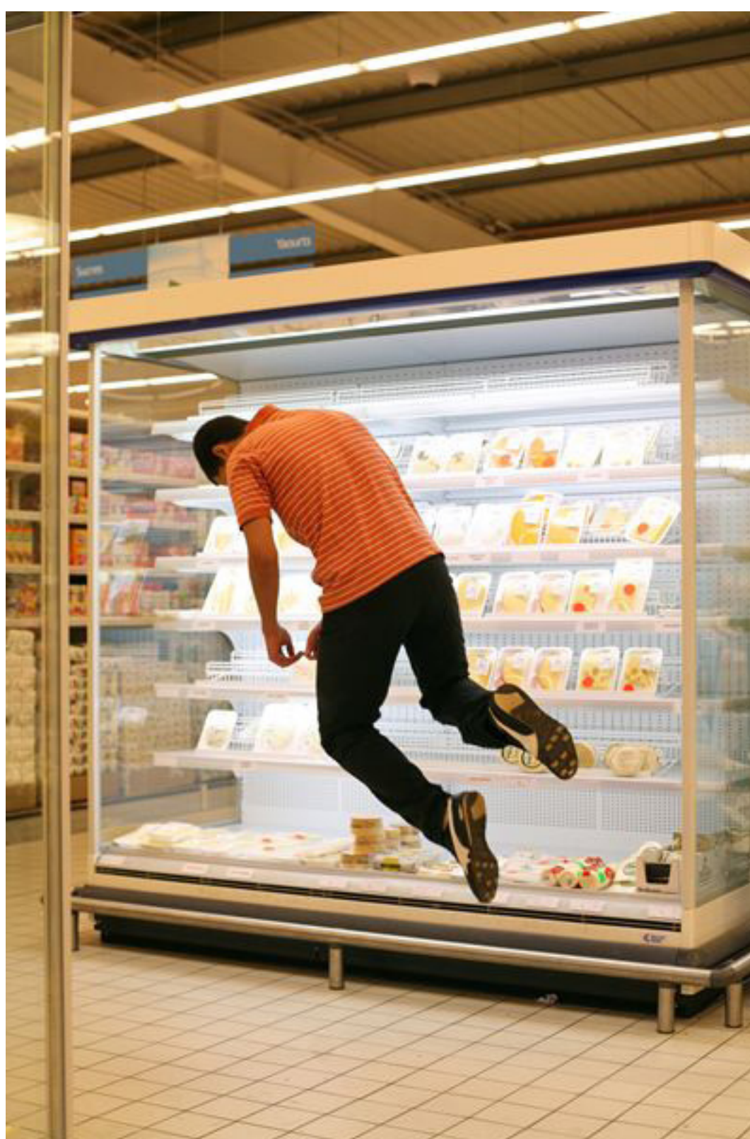
Hyper NO 3. Denis Darzacq. 2007