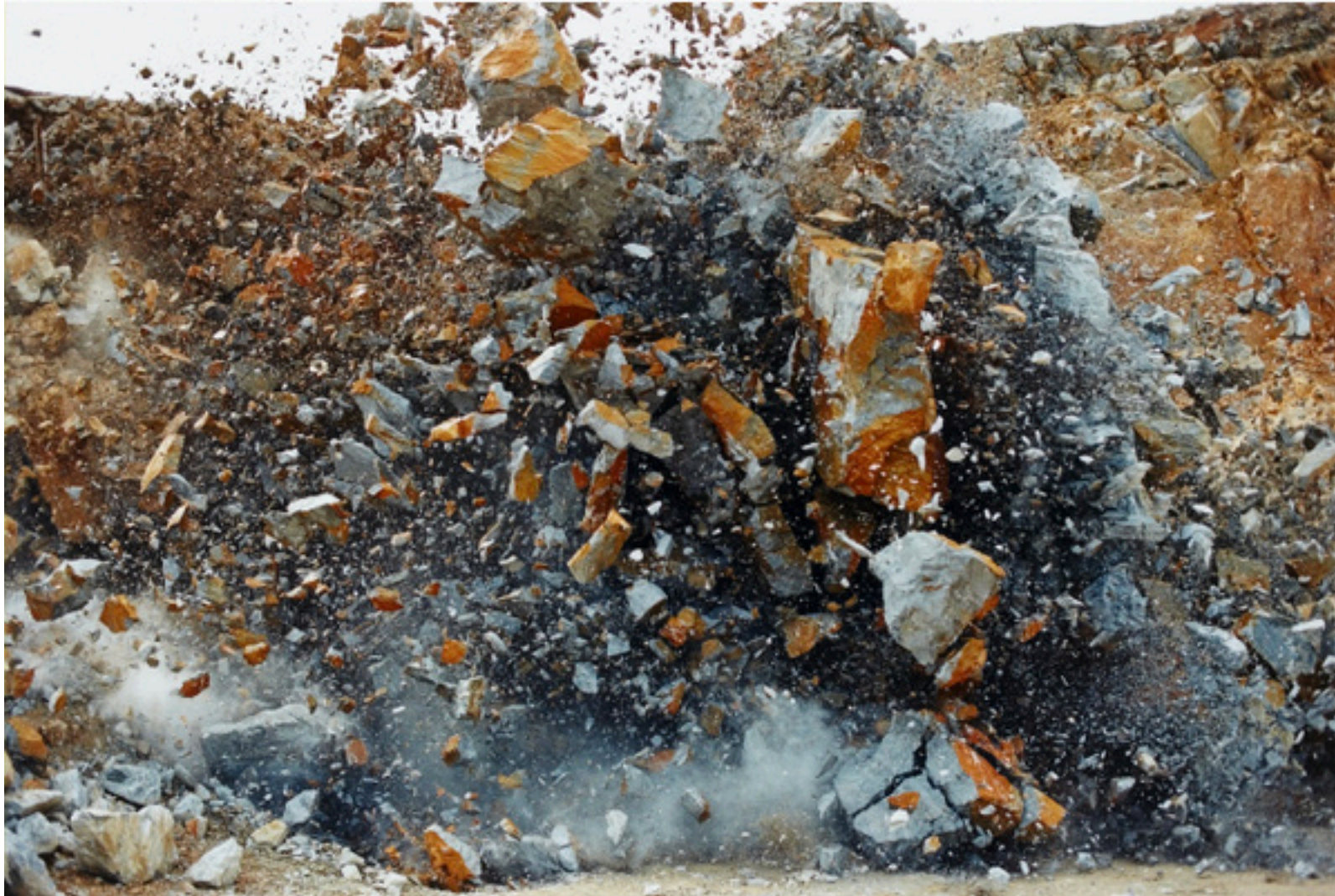
Blast #8318. Naoya Hatakeyama. 1997

A FAST SHUTTER can capture action. Remember: This requires A LOT of light.