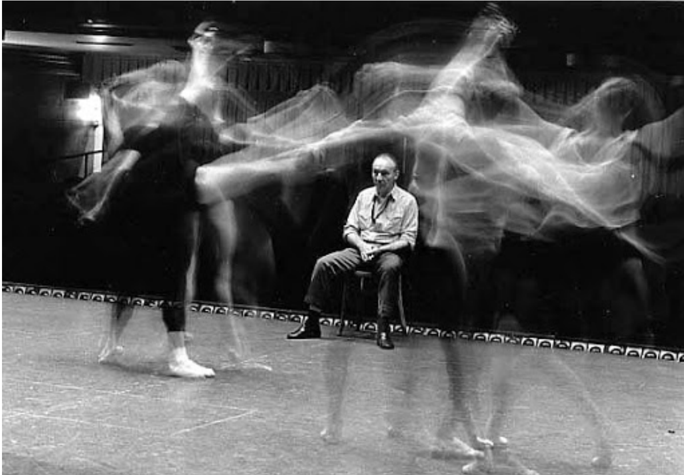
George Balachine. 1960

A Slow Shutter will make action blurry. Be Careful! If your camera moves, the whole image will be blurry, so use a tripod or set your camera down.