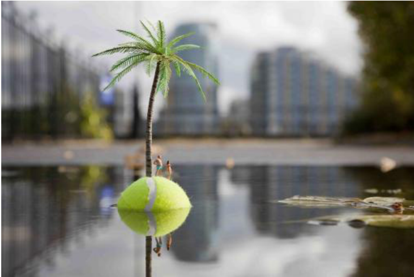
Island. Slinkachu. 2013

BE CAREFUL: It's easy to get a soft focus, so make sure your subject is SHARP .