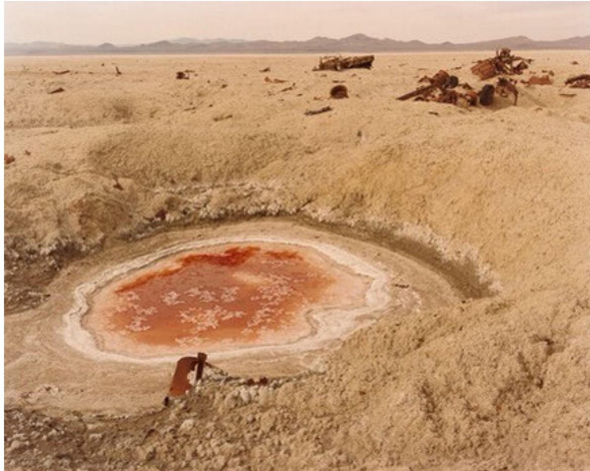
Bomb Crater & Destroyed Convoy. Richard Misrach. 1986

Remember: You'll need a lot of light to keep correct EXPOSURE.