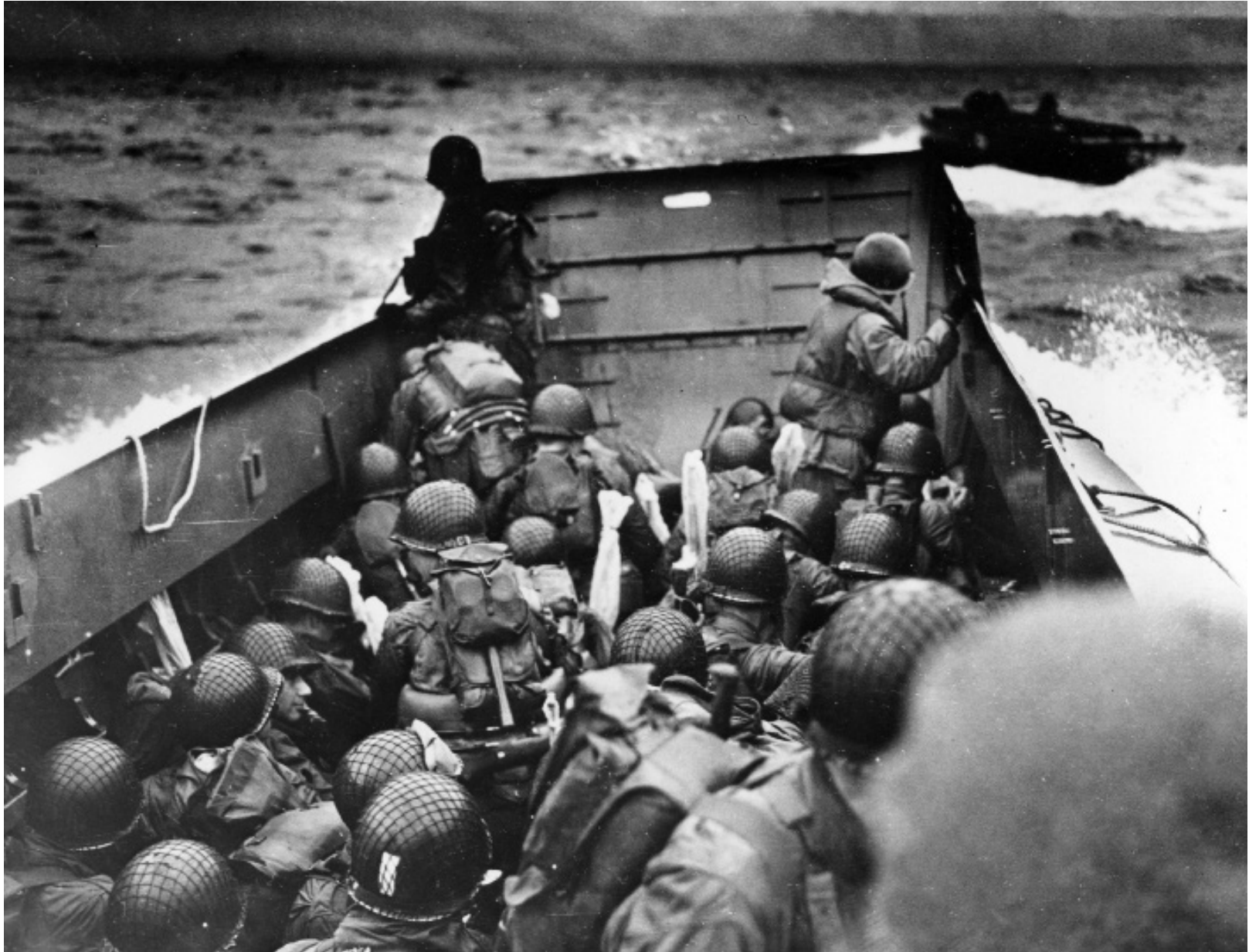
Landing of the American Troops on Omaha Beach. Robert Capa. 1944