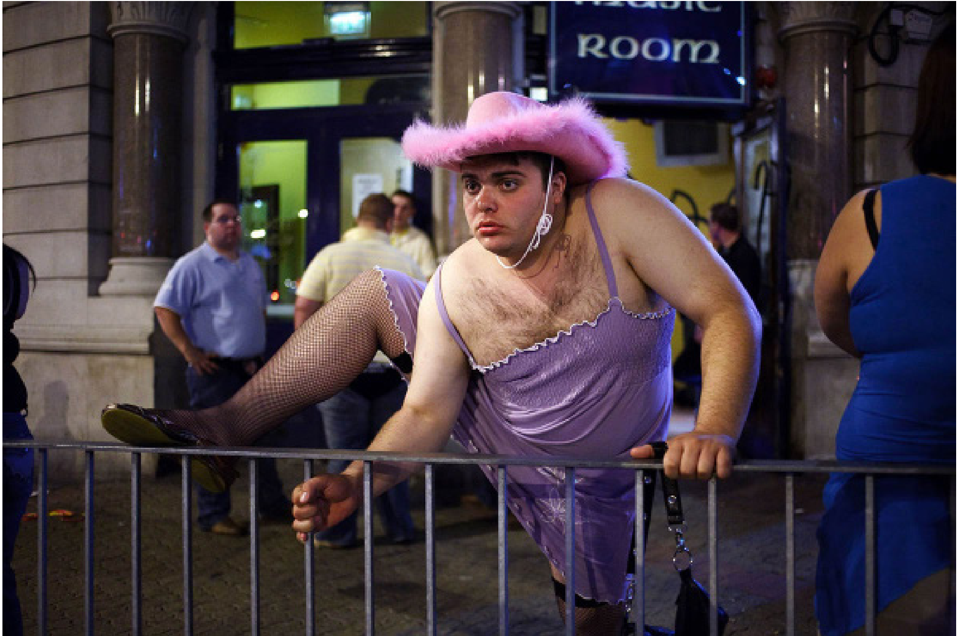
Cardiff After Dark. Maciej Dakowicz. 2006

Zero in on your subject and KNOW what you're looking for.