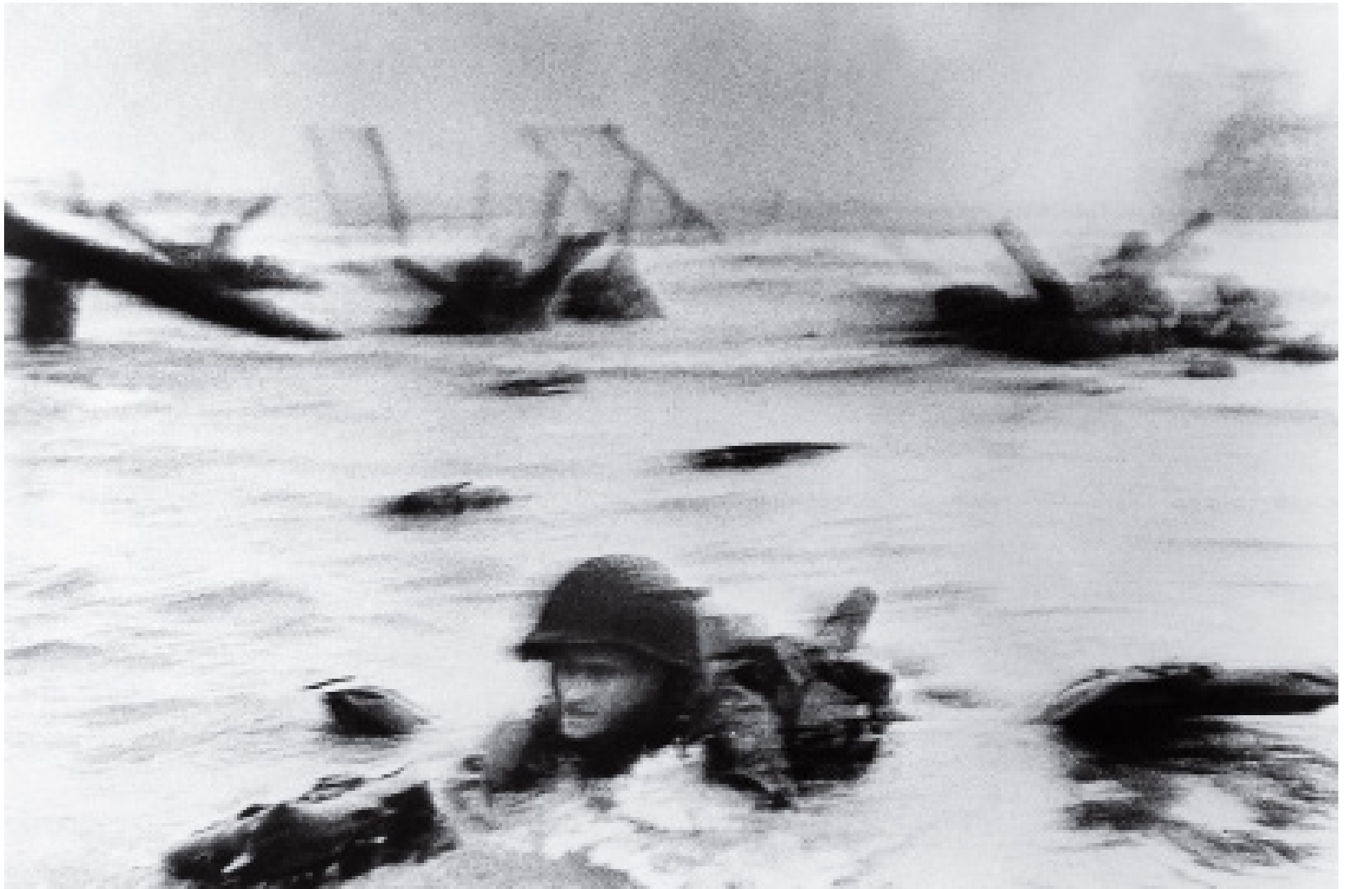
Landing of the American Troops on Omaha Beach. Robert Capa. 1944