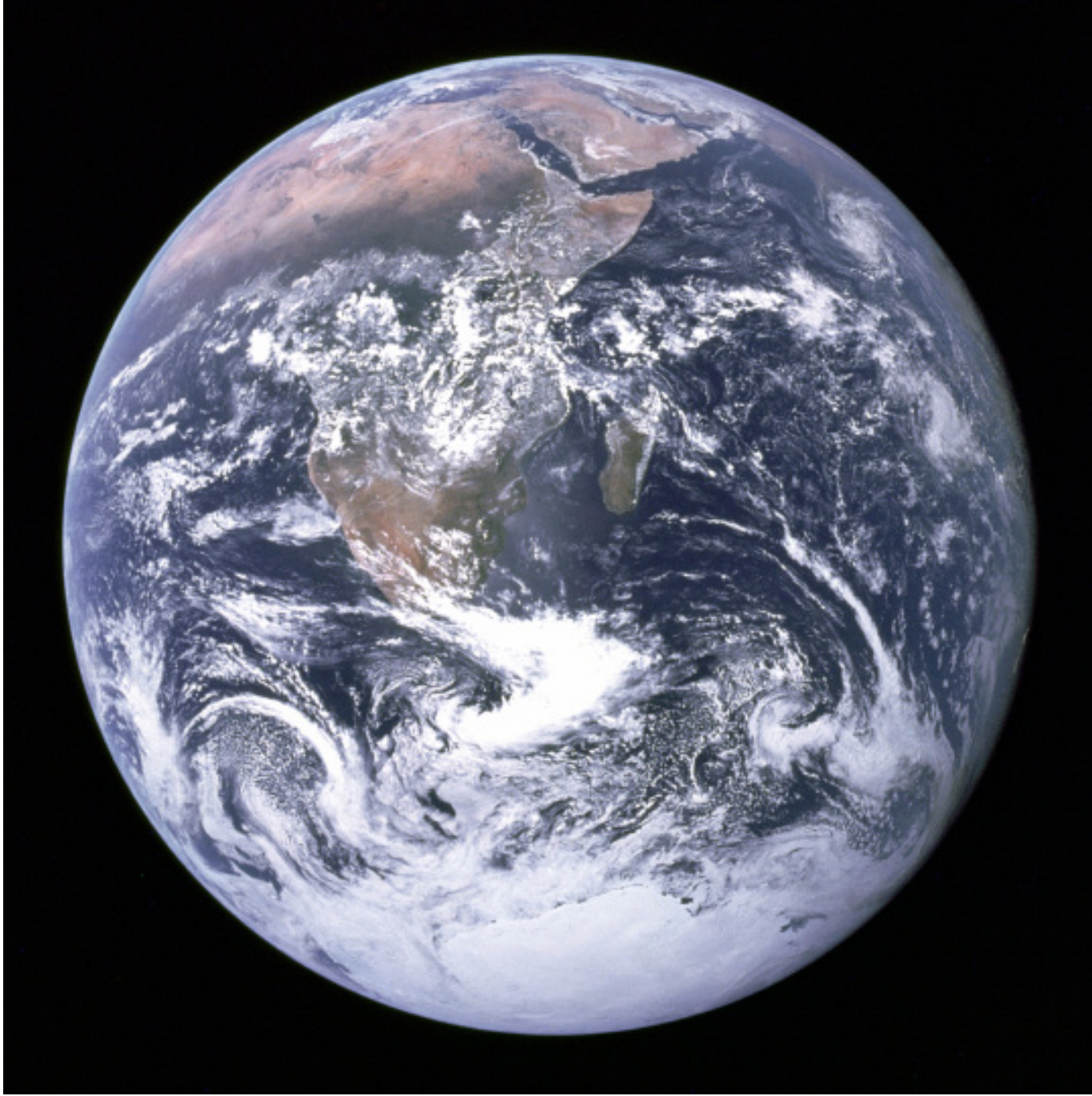
NASA Picture of Earth. Apollo 17.1972

Getting a good shot isn't often easy. Sometimes you have to work for it by going further than anyone else.