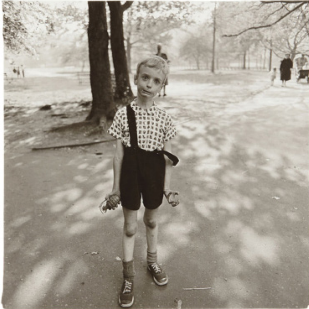
Child with a Toy Hand Grenade in Central Park. Diane Arbus. 1962

Pose questions! Make your photo intriguing.