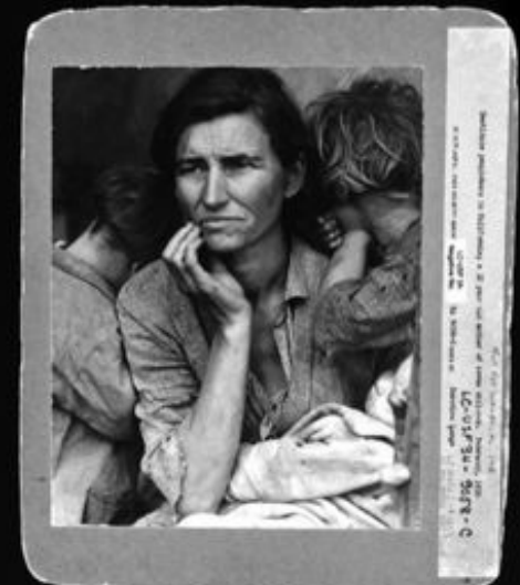
Migrant Mother. Dorothea Lange. 1936